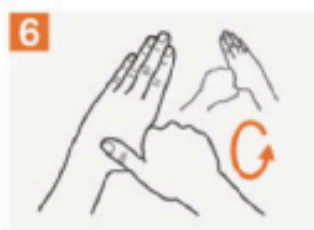
Rotational rubbing of left thumb clasped in right palm and vice versa;