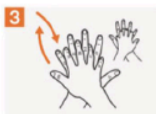
Right palm over left dorsum with interlaced fingers and vice versa;