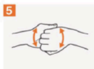
Backs of fingers to opposing palms with fingers interlocked;