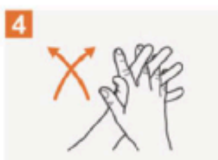
Palm to palm with fingers interlaced;