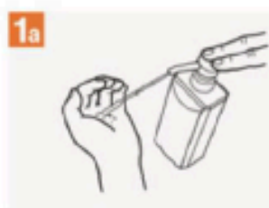
Apply a palmful of the product in a cupped hand, covering all surfaces;

⌚ Duration of the entire procedure: 20-30 seconds